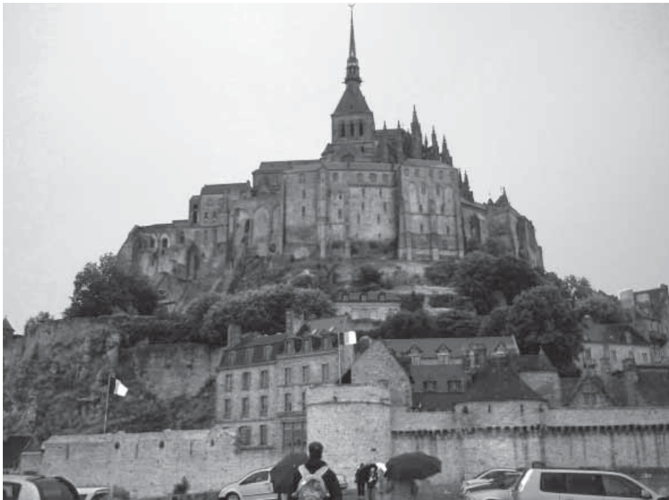
Mont Saint Michel, France

were passed down through the generations by their families.