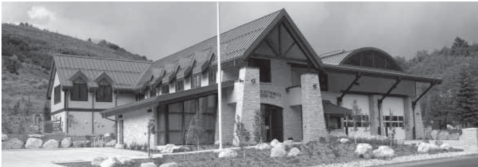
Emigration Canyon Fire Station

to work with over the past 46 years, and we hope to work together on many more masonry projects in the future.